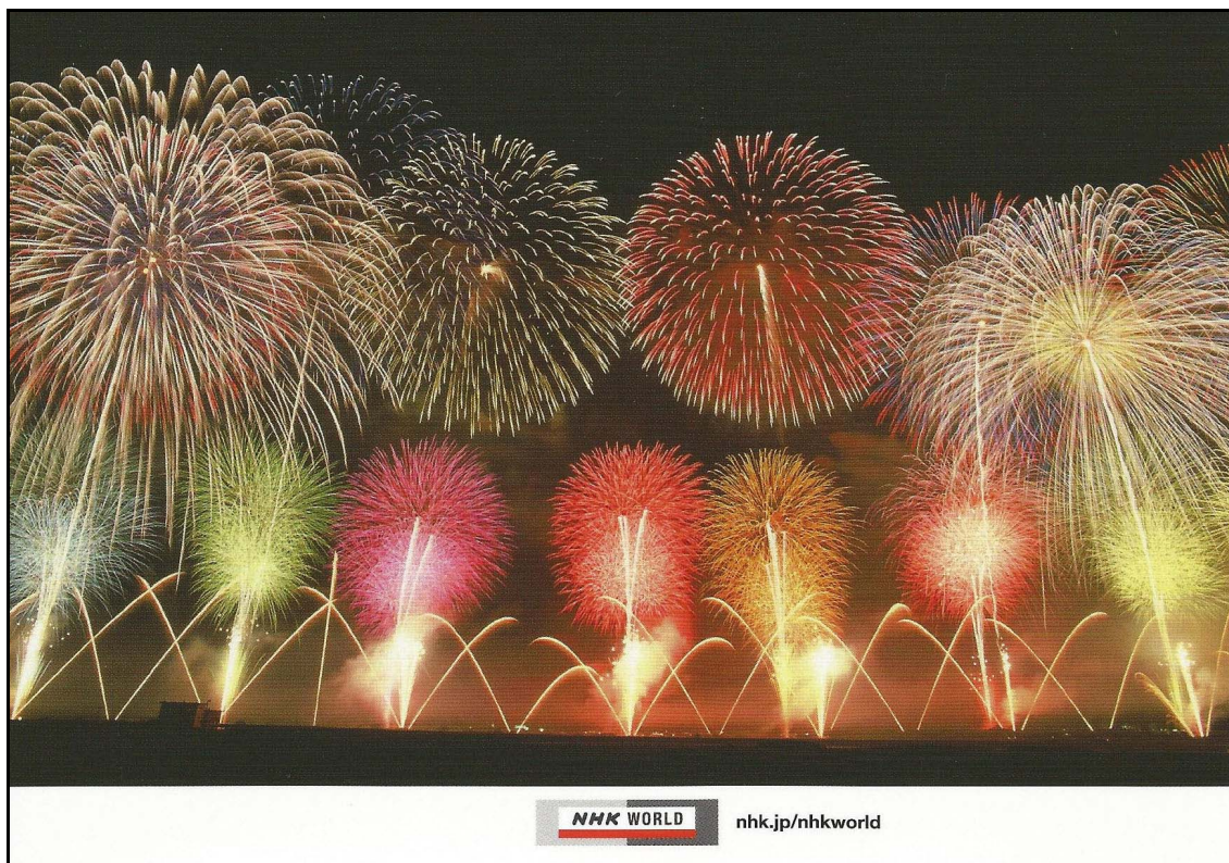
QSL card of NHK Tokyo for report on transmission via Issoudun

DX MAGAZINE is the monthly publication of WORLDWIDE DX CLUB, Postfach 12 14, D-61282 Bad Homburg, Germany. Price for a single copy: € 1.50 or 2 International Reply Coupons (IRC's); annual subscription rate: € 18.00. Other currencies and air mail rates on request. Cover: Peter Pohle + Jürgen Kauer (KAVOP)