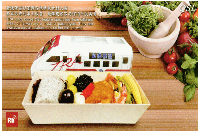
Radio Taiwan International QSL

U.K.: Radio Taiwan International 3955 kHz via Woofferton. German programme. Full data coloured QSL Card "2018-3 Puyuma Lunch Box" in English. Received in 13 days (6 days air mail delivery) for e-mail report to German service (HJB)