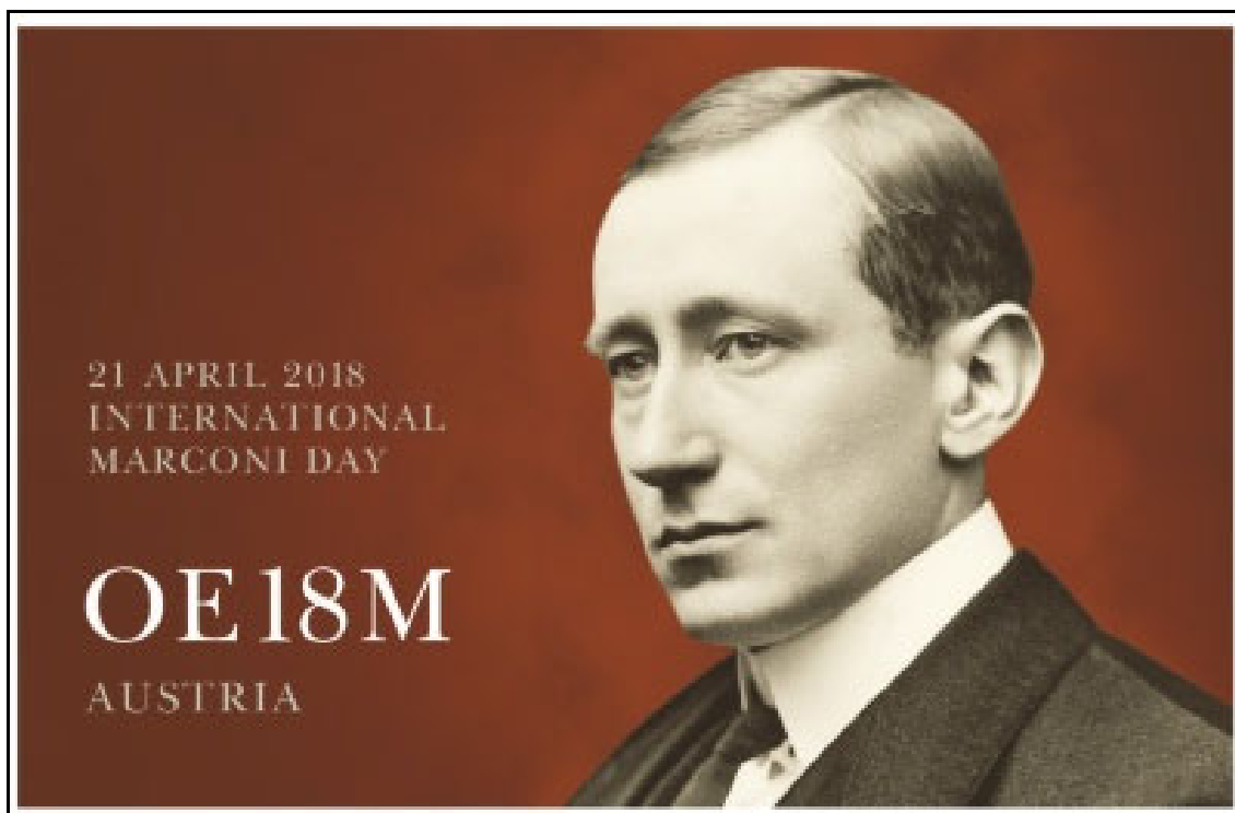
2018 QSL card on the event of International Marconi Day

DX MAGAZINE is the monthly publication of WORLDWIDE DX CLUB, Postfach 12 14, D-61282 Bad Homburg, Germany. Price for a single copy: € 1.50 or 2 International Reply Coupons (IRC's); annual subscription rate: € 18.00. Other currencies and air mail rates on request. Cover: Peter Pohle + Jürgen Kauer (KAVOP)