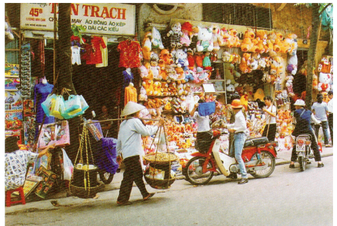
Voice of Vietnam QSL

Vietnam: Stimme Vietnam 7280/9730 kHz. German programme. Full data coloured QSL Card (shepherds) in German plus hand written greeting card. Received in 34 days (13 days alone for air mail delivery from Hanoi) for e-mail report to German service. (HJB)