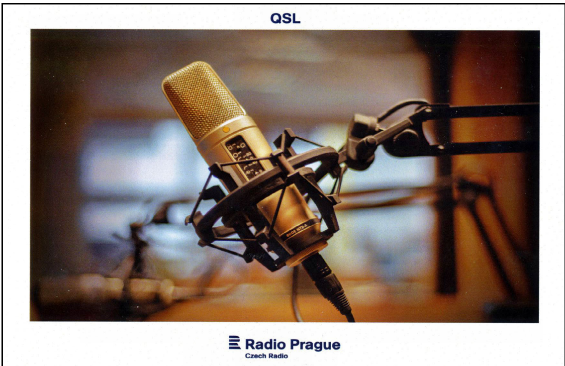
One of the 8 new QSL cards of the 2019 QSL series of Radio Prague, Czech Republic

DX MAGAZINE is the monthly publication of WORLDWIDE DX CLUB, Postfach 12 14, D-61282 Bad Homburg, Germany. Price for a single copy: € 1.50 or 2 International Reply Coupons (IRC's); annual subscription rate: € 18.00. Other currencies and air mail rates on request. Cover: Peter Pohle + Jürgen Kauer (KAVOP)