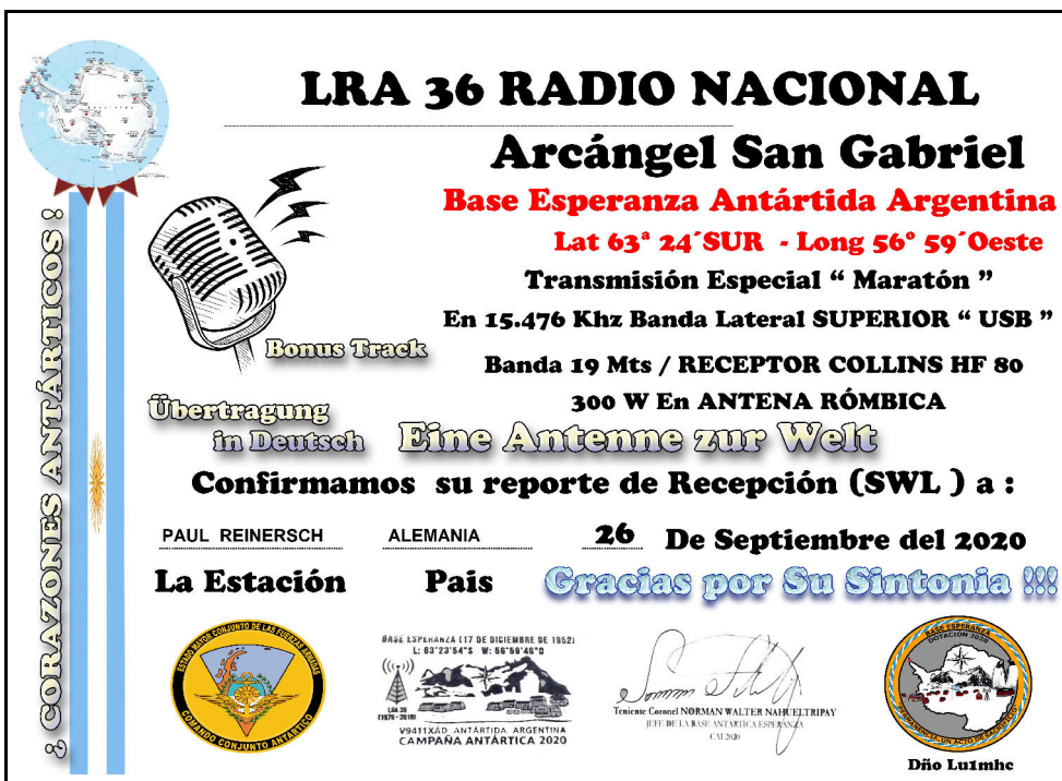
QSL LRA 36, Argentine Antarctica, for special transmission on 15476 kHz

DX MAGAZINE is the monthly publication of WORLDWIDE DX CLUB, Postfach 12 14, D-61282 Bad Homburg, Germany. Price for a single copy: € 1.50 or 2 International Reply Coupons (IRC's); annual subscription rate: € 18.00. Other currencies and air mail rates on request. Cover: Peter Pohle + Jürgen Kauer (KAVOP)