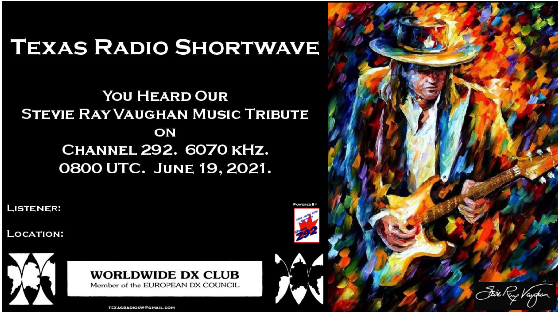
eQSL for reports on Texas Radio Shortwave programme on June 19 th , 2021 (see page 3)

DX MAGAZINE is the monthly publication of WORLDWIDE DX CLUB, Postfach 12 14, D-61282 Bad Homburg, Germany. Price for a single copy: € 1.50 or 2 International Reply Coupons (IRC's); annual subscription rate: € 18.00. Other currencies and air mail rates on request. Cover: Peter Pohle + Jürgen Kauer (KAVOP)