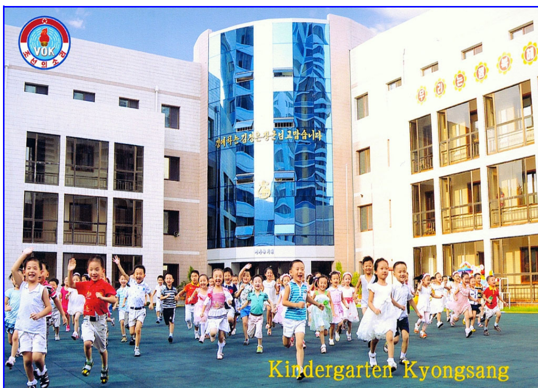
QSL of Voice of Korea, German Section, Pyongyang, via Paul Reinersch, Germany

DX MAGAZINE is the monthly publication of WORLDWIDE DX CLUB, Postfach 12 14, D-61282 Bad Homburg, Germany. Price for a single copy: € 1.50 or 2 International Reply Coupons (IRC's); annual subscription rate: € 18.00. Other currencies and air mail rates on request. Cover: Peter Pohle + Jürgen Kauer (KAVOP)